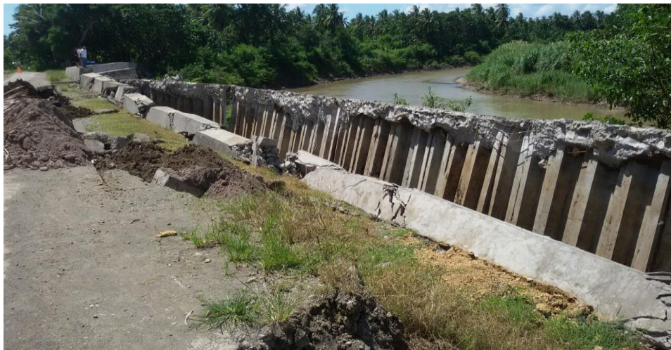
Figure 4. Flood Control Building

Several models of physical adapt that become people's habits and cultures are identified in the field. Most of these adaptation efforts started at the household level, especially the model of building houses in the form of stilt houses (Atmaja & Fukushi, 2022; Riza et al., 2020). The stilt house consists of two parts: the bottom and the top. The lower part usually stores goods, agricultural materials, and vehicles. In contrast, the upper part is used to rest and perform daily routines such as cooking, chatting with neighbors, receiving guests, etc. Nevertheless, when water inundates the bottom of the house in extreme conditions, the belongings are immediately moved to the top of the house, and the vehicle is taken to a higher place. Joint adaptation measures were also carried out between households in the local Community, especially by building temporary embankments to prevent water from entering residential areas. An example of some of the adaptation actions taken is shown in Figure 4 .