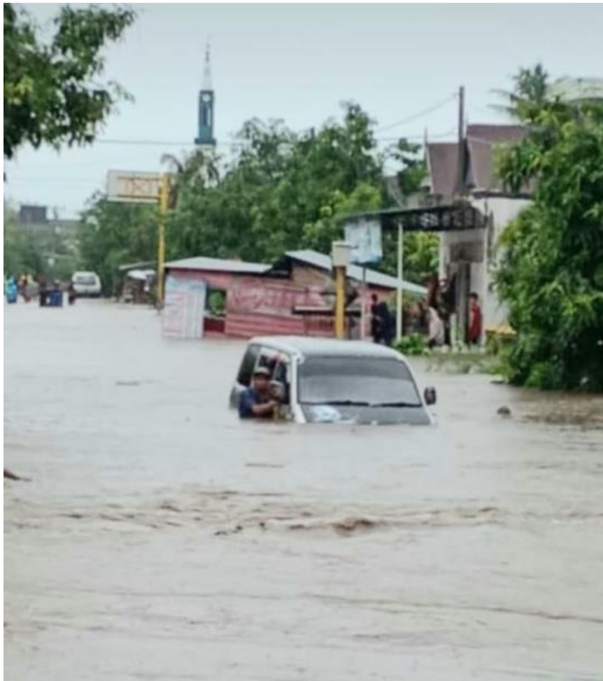
Figure 3. Flooding covering highways

Floods in 2019 were the largest floods that occurred in Soppeng Regency, with water levels reaching 30 to 60 cm, figure 3 . There are two affected sub-districts, namely Donri Donri district and Marioriaawa sub-district, precisely in Tellulimpoe Village and Kassing Village. According to the Head of BPBD Implementation, Soppeng Regency, the flood resulted in losses of around 43 billion. The high gloss is not only the houses of the affected residents but also the rice fields and plantations of the residents are also flooded. There are about 2,217.42 hectares of flooded rice fields. Meanwhile, for plantation land, there are around 1,368.64 hectares that are also flooded.