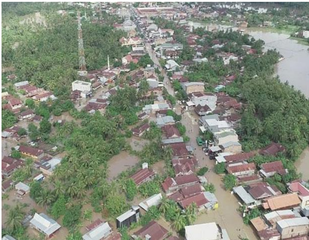
Figure 2. Flood Events in Soppeng Regency

Most of the communities affected by the flooding are located near the riverbanks. The condition of residential area is opposite the river, with the structure of wooden house buildings (not permanent). The inner building material of the house consists of old wood and bamboo, while the roof uses zinc. The condition of the building is a characteristic of the building at the research site. Some wooden house buildings with poles are already hanging above the riverbank, so they must be tied with ropes to strengthen the house building. Despite this, new buildings have sprung up on the riverbanks because it became a habit and desired to gather with their close relatives figure 2 .