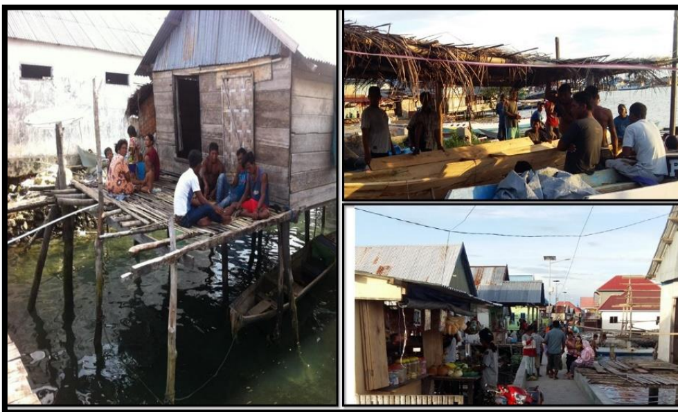
Figure 2. The Portrait of people's daily lives in the afternoon

In their daily lives, the Bajo people spend more time gathering in front of the house and this is a symbol of togetherness and strong family ties. If there are neighbors (fishermen) who get excess sea products, usually the results are distributed to neighbors around their house. This has become a habit that continues to this day, and for the Bajo people, they never feel short of food supplies. Because according to the Bajo Mola people, the sea is their source of life and they never lack it.