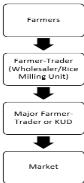
Figure 3. Flowchart of selling grain in Malang Regency

The third problem concerns the habits of grain farmers who make direct sales. Farmers in Malang Regency tend to sell goods immediately after planting. They think keeping the goods in the warehouse does not give them any advantage. In addition, if the market price in the harvest season is reasonable (as in 2012-2018), they do not need to save the harvest from getting a favorable price. The Padita Farmers Cooperative is one of the cooperatives in Tumpang that buys grain from farmers. The cooperative has a warehouse and a rice mill unit.