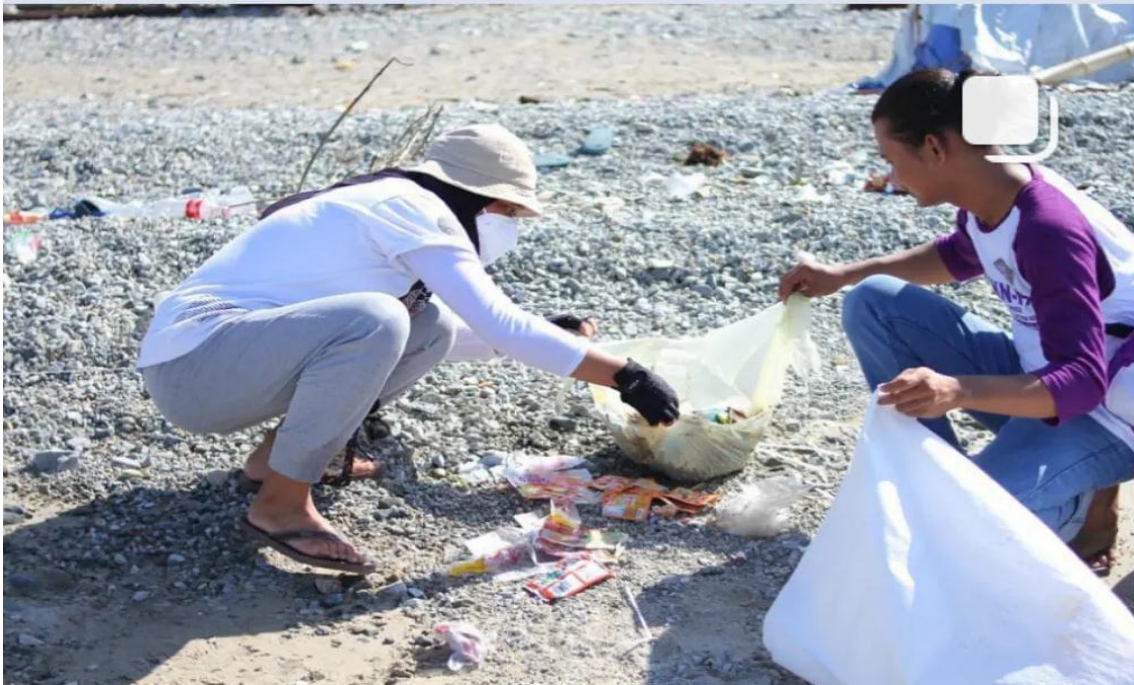
Figure 4. Waste Sorting Products at Whale Shark Tourism Sites

program. As well as the socialization of waste in elementary schools in the village of Botubarani.