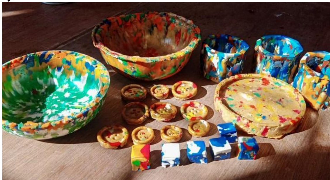
Figure 3. Waste Sorting Products