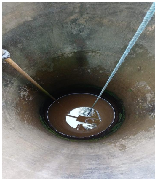
Figure 1. Condition of community wells in Ayula Selatan Village.

Field observations also confirmed the absence of piped distribution networks or centralised treatment facilities. This condition increases the reliance on self-managed water sources, where storage and sanitation practices directly affect drinking water safety (Sapta et al., 2025). Although bore wells generally offer better microbiological quality than surface water, poor construction or irregular maintenance can result in contamination of the water. The importance of systematic groundwater quality monitoring has been emphasised, as regular testing can reduce the risk of microbial and chemical contamination (Febriwani et al., 2019). Figure 1 illustrates a dug well in Dusun I, where residents reported frequent turbidity during the rainy seasons. These findings align with those of previous studies showing that shallow groundwater in tropical lowlands is vulnerable to the infiltration of domestic wastewater (Marisdayana, 2022). Therefore, strengthening groundwater management through community education, improved well design, and routine monitoring is crucial in this region. Integrating household-level interventions, such as safe storage practices and low-cost filtration technologies, with village-level policy support is essential to ensure sustainable improvements in water quality (Hasyti, 2024).