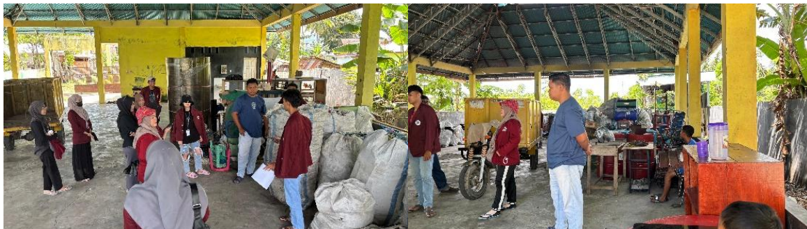
Figure 3. Condition of TPS 3R in Ayula Selatan Village.

service delivery (Kurniawati et al. 2024). Community-based organisations further enhance ownership and accountability in waste management programs (Nurchahya et al., 2022). In Ayula Selatan, insufficient human resources and weak institutional support hinder these outcomes. Training waste transport workers could improve technical efficiency, while scheduled waste collection could prevent accumulation (Ridayati & Yunastiawan, 2022; Mulya et al., 2024). Integrating policy with community-based education can encourage sustainable waste management practices (Utomo et al., 2024).