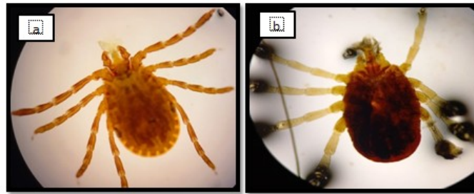
Figure 1. Ectoparasites in Cattle. Dermacentor sp. (a) and Boophilus sp. (b)

Based on the picture, it can be seen the differences in the morphology of the two genera of ticks. On Dermacentor sp. The body consists of the cephalothorax and the abdomen has four pairs of legs, each consisting of six segments, the capitulum consists of the base of the capitulum and the mouth, the mouth consists of the hypostoma, chelicera and pedipalps. The male scutum tick covers the entire dorsal surface, the female only anteriorly (Dryden et al, 2008). Boophilus sp. has an ornament