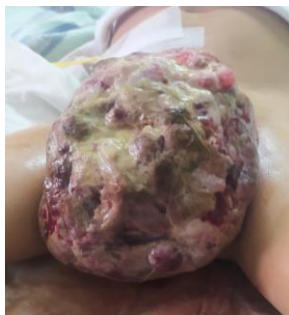
Figure 2: Clinical picture after 2 cycles of chemotherapy

Our patient had undergone intravenous chemotherapy for total of 6 cycles using CEBA (cisplatin, etoposide, bleomycin and doxorubicine) protocol. Reduction of tumor sizes were seen after the first 2 cycles of chemotherapy with CEBA protocol (FIGURE 2) and continued to shrunk after 4 cycles. (FIGURE 3 & 4)