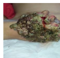
Figure 1: Clinical picture before chemotherapy

Signs and symptoms of YST can vary, expect the common signs and symptoms of malignancy like fever or decrease of body weight, testicular YST may presents with mass at the testes. The most common presentation is of a painless scrotal mass, pain may be associated when torsion of the testes or intra tumoral hemorrhage occurs. Torsion had been reported to occur in about 60% of cases of intraabdominal testicular tumors in prepubertal children. (9) Our patient presented with palpable painful mass that easily bleed, possibly caused by the intra-tumoral haemorrhage (FIGURE1). Other symptoms were unremarkable. Nicholson and Harlan (1995) reported that around one-third of patients with testicular cancer carry genetic predisposition, however our patient had no familial history of malignancy.