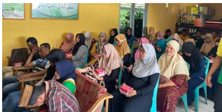
Figure 2. Socialization of Climate Vulnerability and Adaptive Capacity

Obstacles in implementing community adaptive capacity behaviors are low awareness of climate change. In general, the people of Bilato village are not aware of the impact of climate change. The climate change phenomenon is not an urgent problem for the people of Bilato village. The impact that is felt does not occur directly, so the community thinks it is not an urgent problem. Indirectly, the community, especially fishermen, felt the impact, namely a decrease in fish catches.