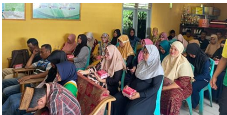
Figure 2. Socialization of Climate Vulnerability and Adaptive Capacity

Obstacles in implementing community adaptive capacity behaviors are low awareness of climate change. In general, the people of Bilato village are not aware of the impact of climate change. The climate change phenomenon is not an urgent problem for the people of Bilato village. The impact that is felt does not occur directly, so the community thinks it is not an urgent problem. Indirectly, the community, especially fishermen, felt the impact, namely a decrease in fish catches.