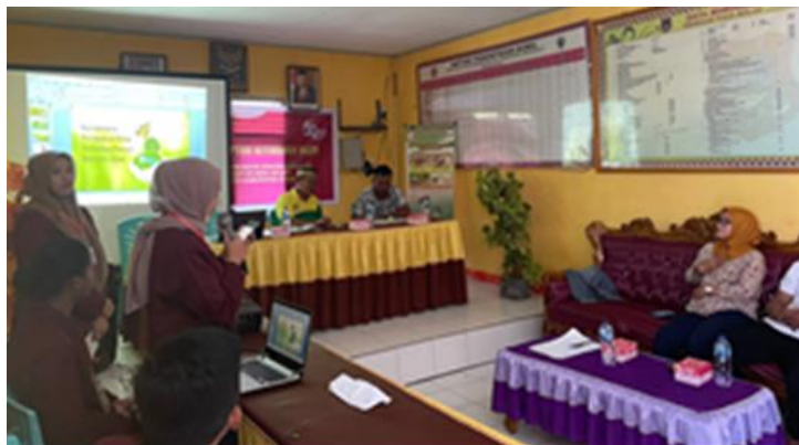
Figure 3. Question and Answer Session

This can help fishermen learn more about how to adapt to the Climatepreneurship strategy. Resource management is closely related to how community action plans affect an individual's ability to adapt. The ability of people to adapt to climate change depends on how well they can use their resources. Residents try to get around the problem of climate change in several places by following a similar pattern. To deal with climate change, fishermen need to have other livelihoods. Other livelihoods can help fishermen's economic conditions when not at sea (Ulfa, 2018). Fishermen can do other jobs such as farming, construction workers, coconut picking workers, and so on. Thus other livelihoods can help the fishermen's economy.