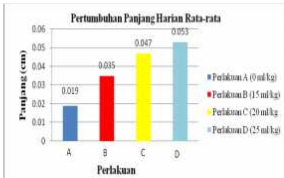
Figure 3. Average length growth

treatment D (VITERNA dose of 25 ml / kg) can be seen in Figure 3 and Figure 4.