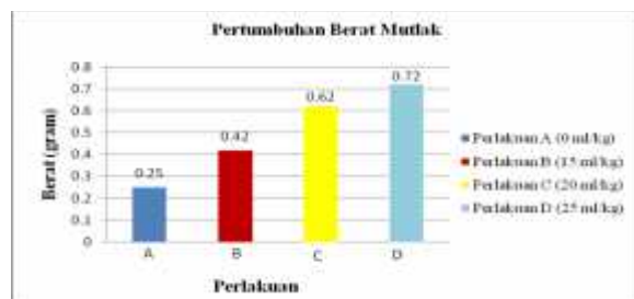
Figure 2. Growth Absolute Weight Fish Seed iridescent shark

The results of measurements of the average weight of absolute seed Siamese catfish ( Pangasius hypophthalmus ) for 35 days according to treatment can be seen in Figure 2.