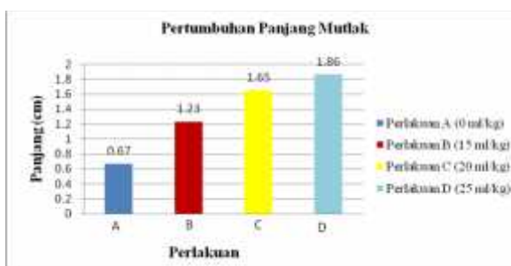
Figure 1. Growth Absolute Length Fish Seed iridescent shark

Length growth the absolute seed catfish Siamese ( Pangasius hypophthalmus ) for 5 weeks, using four treatments the addition VITERNA plus with different doses of the treatment of A (0 ml / kg), treatment B (15 ml / kg), C treatment (20 ml / kg) and treatment D (25 ml / kg) can clearly be seen in Figure 1.