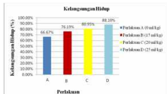
Figure 5. Kelangsungan Hidup Benih Ikan Patin Siam

Survival is the ratio of the number of organisms that live in akhirperiode by the number of organisms that live at the beginning of the period. Seed viability catfish Siamese (Pangasius hypophthalmus) for 35 days of maintenance which uses four treatments with increasing doses VITERNA different in the feed ie A treatment with doses of 0 ml / kg, treatment B at a dose of 15 ml / kg, treatment C 20 ml / kg and treatment D at a dose of 25 ml / kg can be seen in Figure 5.